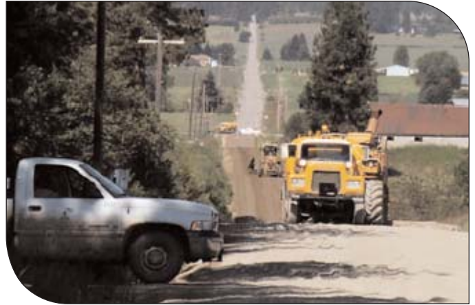
Figure 5 – FDR construction, Spokane County, WA.

Most agencies use equipment called a "reclaimer" to pulverize their old, distressed flexible pavements so that the maximum size of the crushed pavement is no more than 2.5 to 3.0 inches (63 to 75 mm). If thicker sections are required, some agencies add aggregate or soil base material and blend them with the pulverized pavement. Water and cement are then added in either a dry or slurry form to the pulverized material to form a stabilized mixture, which is compacted and becomes the base or subbase of the new pavement structure.