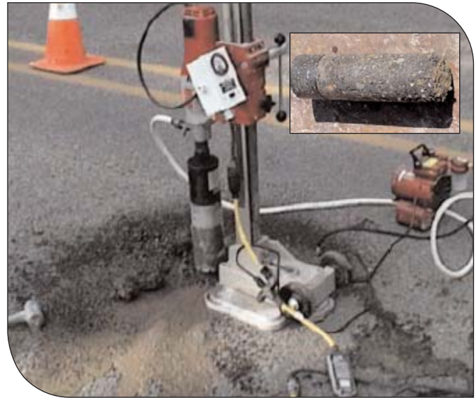
Figure 2 – Extracting FDR cores for unconfined compressive strength testing.

Based on the seismic modulus testing results, the lowest UCS value of 260 psi (1.8 MPa) would roughly correspond to a stiffness of 200,000 psi (1380 MPa), which is considered excellent in terms of the reclaimed base’s ability to support traffic loads and minimize the stress that is transferred to the subgrade.