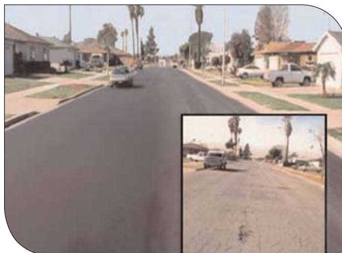
Figure 6 – Before and after photos of FDR for residential street in Westminster, CA.