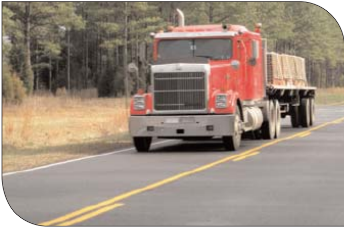
Figure 3 – FDR base provides strong, durable foundation for roadway in South Carolina.