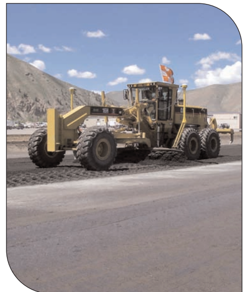
Grader with GPS technology.