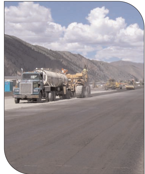
Mixing cement into the failed asphalt base.